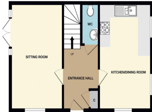
GROUND FLOOR 443 sq.ft. (41.2 sq.m.) approx.