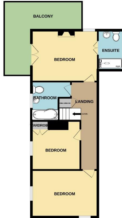
1ST FLOOR 691 sq.ft. (64.2 sq.m.) approx.