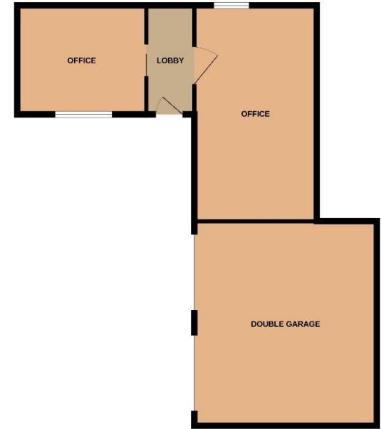
GROUND FLOOR 723 sq.ft. (67.2 sq.m.) approx.