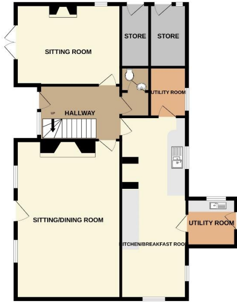
GROUND FLOOR 1054 sq.ft. (97.9 sq.m.) approx.